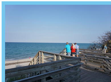
View from Carlin Park, Jupiter FL